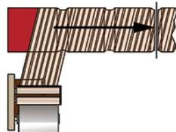
Continuous wrap with hot wire cut